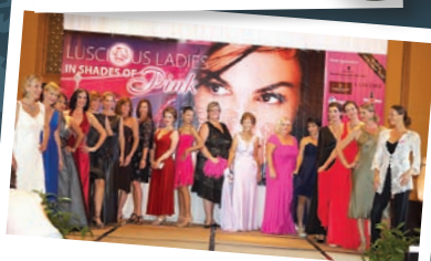
Luscious Ladies Day in Shades of Pink