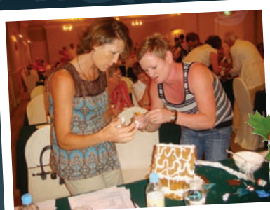
Making your very own Gingerbread House