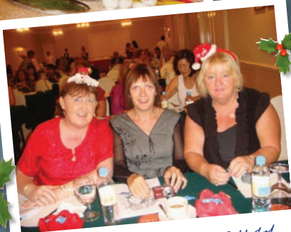
Christmas Cooking at E&O Hotel