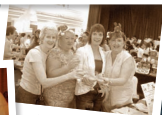
IWA Bazaar 2009