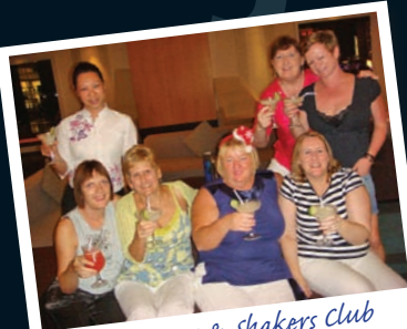
1 st Movers & Shakers Club at G Hotel