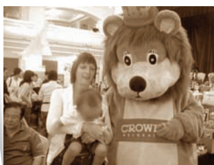
... doing our part for local charities