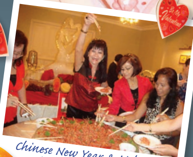
Chinese New Year & Valentine's Celebration among friends