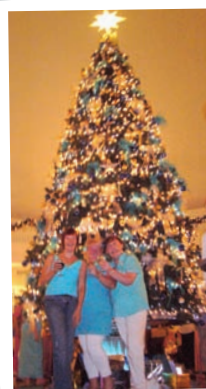
Lighting of the Christmas Tree at E&O Hotel.